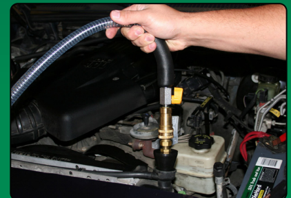
Vacuum & Fill Service