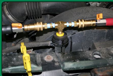
Drain & Fill Service