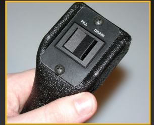
Fingertip controlled pendant with 11' reach allows one tech service.