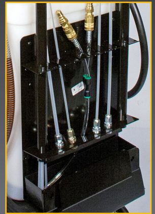
Adapter organizer with removable drip tray