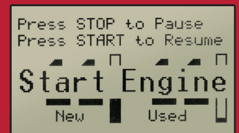
Easy to Follow Prompts