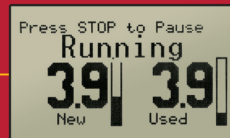
...Flush in Progress...