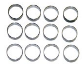
Aisin Solenoid Connector Saver Ring