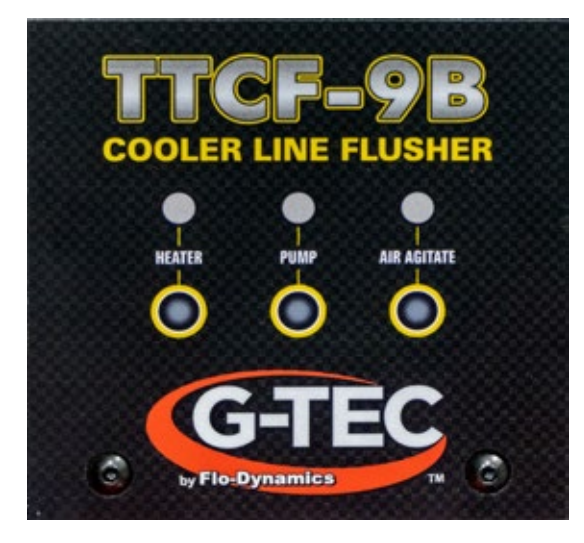
One-touch control panel turns on heater, pump and selectable air-agitate patterns