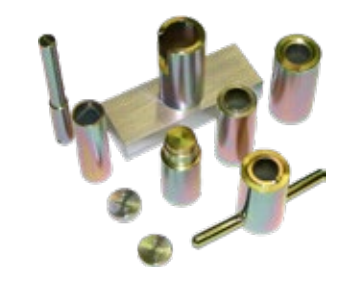
AW Late-Model Small Canister Solenoid Kit