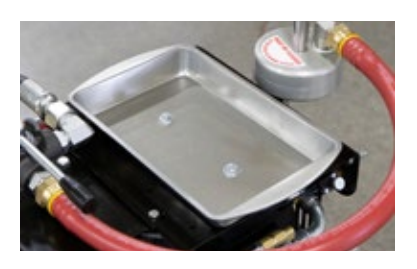
Tool Tray & Bracket