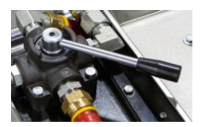
Manual Reverser Kit

Easily monitor fluid flow. Flow decrease indicates blockages. Allows visibility of fluid color to determine when to replace filters.