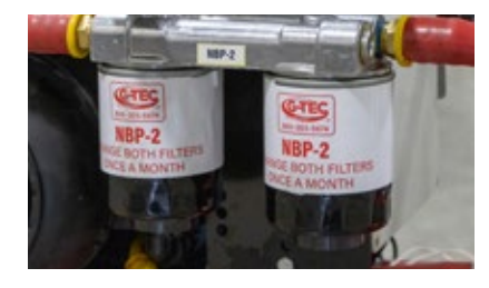
NBP Spin-On Filter

TTCF-MO 40200460 Motor Only TTCF-PO 40200459 Pump Only