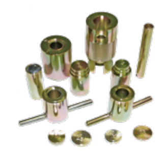
AW Toyota/Lexus Sm/Lg Canister SL Solenoid Kit