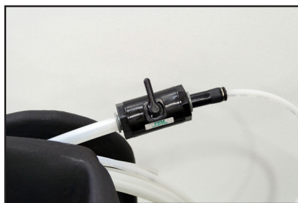
OPEN/CLOSE SERVICE HOSE VALVE