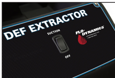
ON/OFF SUCTION SWITCH