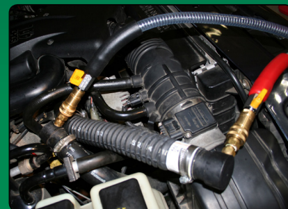
Inline Flush Service