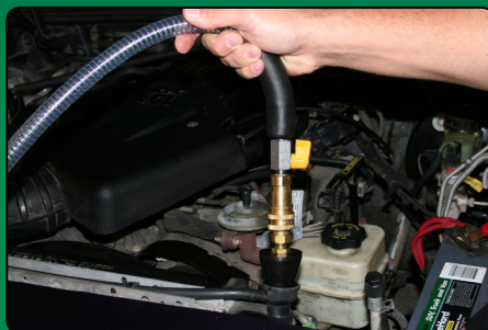
Drain & Fill Service