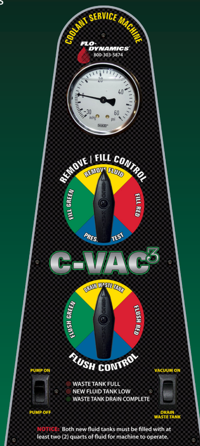
Easy to use control panel