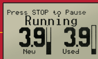
...Flush in Progress...