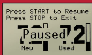
Ability to Stop During Service