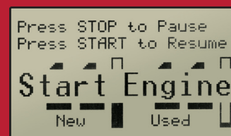
Easy to Follow Prompts