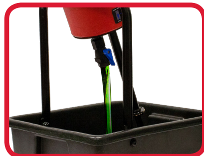
Drains easily into included waste container