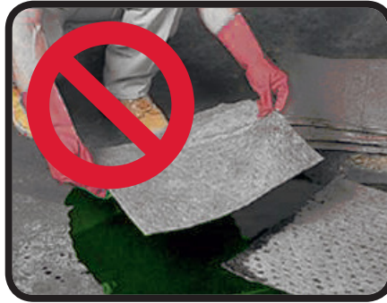
No soggy absorbent pads