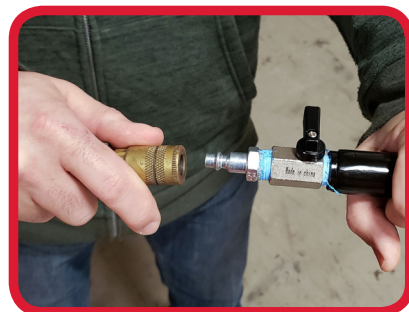
Connects to shop air