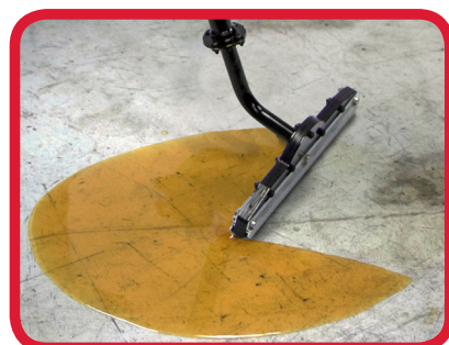
Cleans up fluid spills with ease