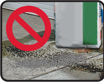
No contaminated pellets