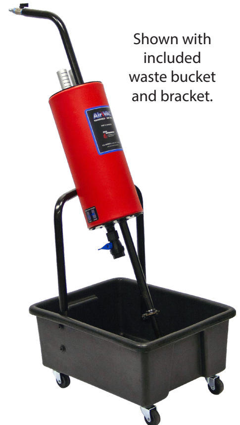
Shown with included waste bucket and bracket.